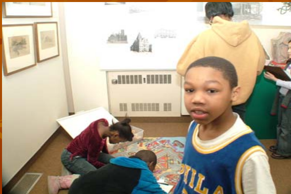
Presentation Prepared by the Onondaga Historical Association Museum & Research Center