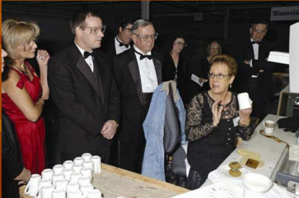
Presentation Prepared by the Onondaga Historical Association Museum & Research Center