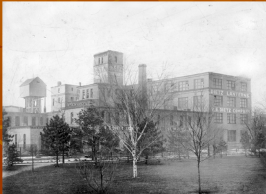
Presentation Prepared by the Onondaga Historical Association Museum & Research Center