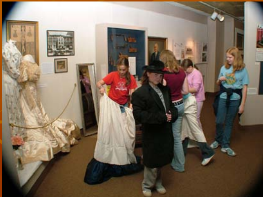
Presentation Prepared by the Onondaga Historical Association Museum & Research Center