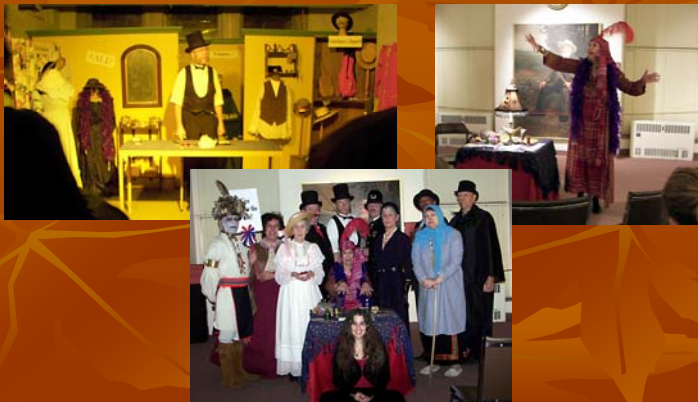
Presentation Prepared by the Onondaga Historical Association Museum & Research Center