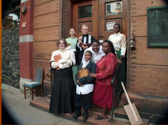
Presentation Prepared by the Onondaga Historical Association Museum & Research Center