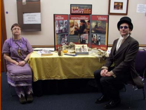
Presentation Prepared by the Onondaga Historical Association Museum & Research Center