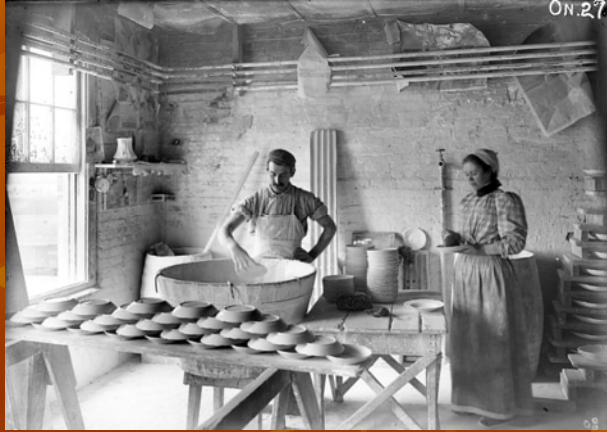
Presentation Prepared by the Onondaga Historical Association Museum & Research Center