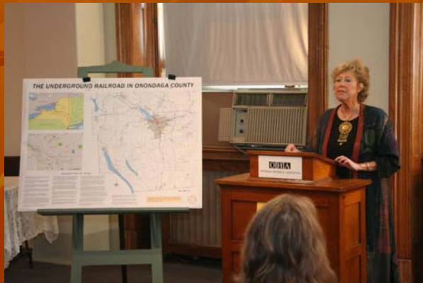
Presentation Prepared by the Onondaga Historical Association Museum & Research Center