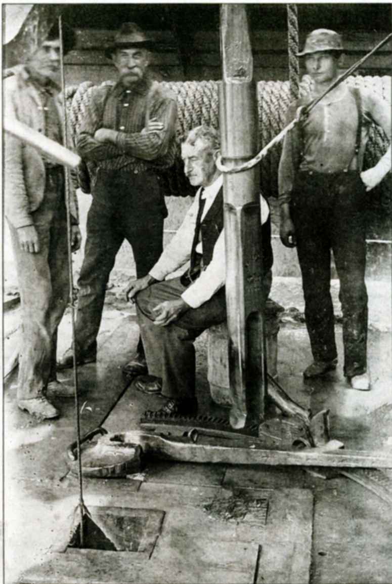
Museum at the Shacksboro Schoolhouse

Those images range from a picture of one of the Baldwinsville area's natural gas wells, which once supplied the city of Syracuse, to shots of canal boats; the village's tobacco industry; and a neat photograph of employees of a pioneer local industry, The New Process Raw Hide Co., from 1888, ancestor of a company that's still among us. The company's first product was a leather-covered canoe, according to Sue.