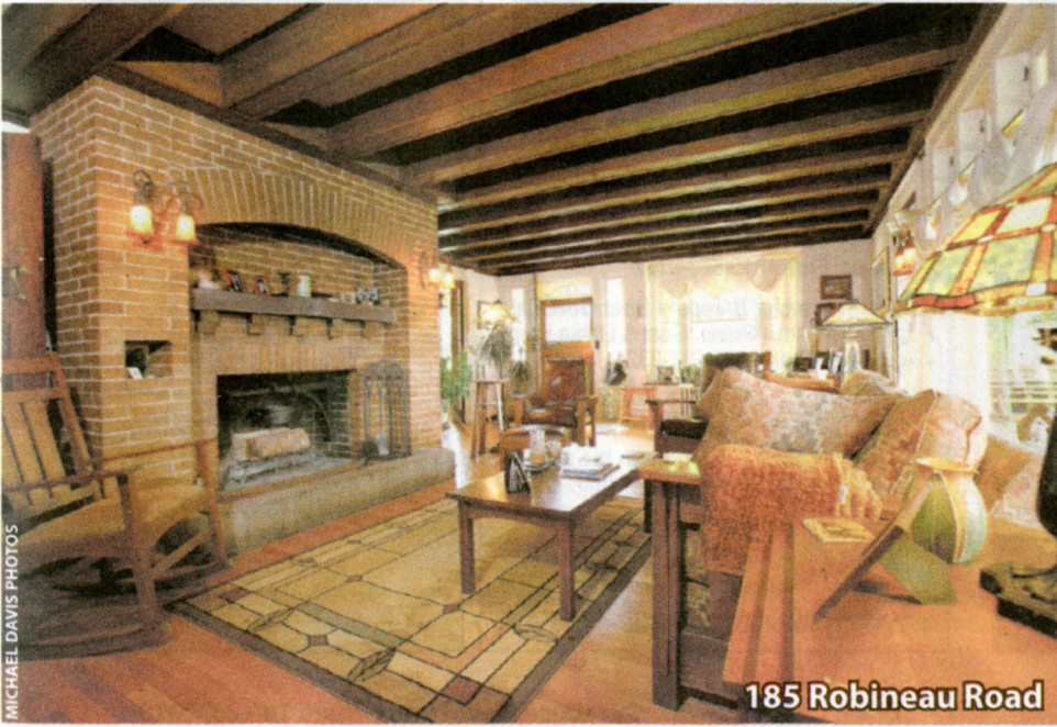
185 Robineau Road