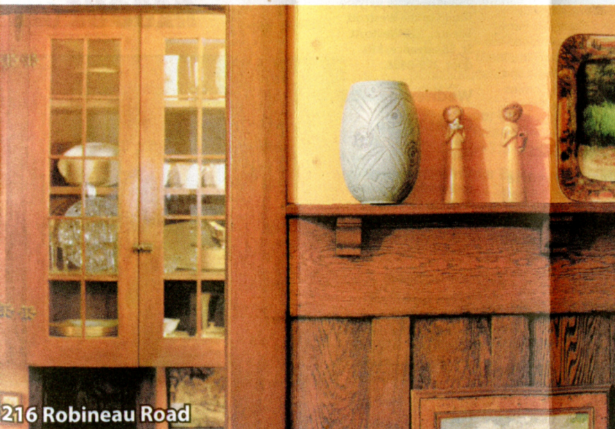
216 Robineau Road

Schedules, locations and directions, prices and reservation information for all events are all available on the Onondaga Park Association website, strathmorebythepark.org . □