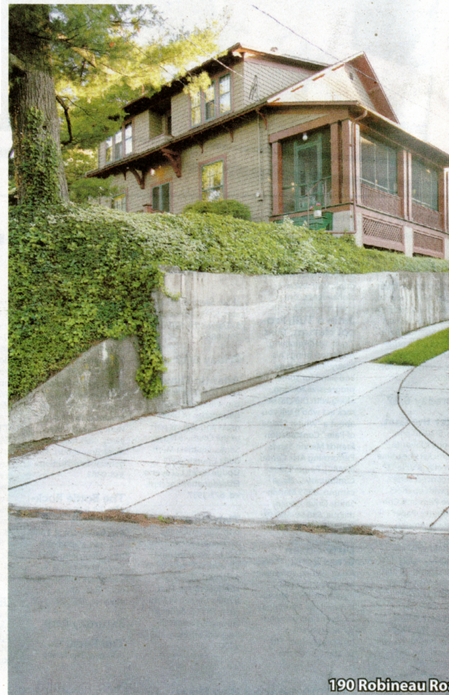
190 Robineau Road