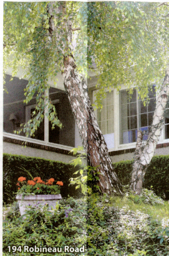
194 Robineau Road