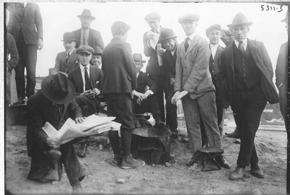
Outside Ebbets Field, ca. 1920.