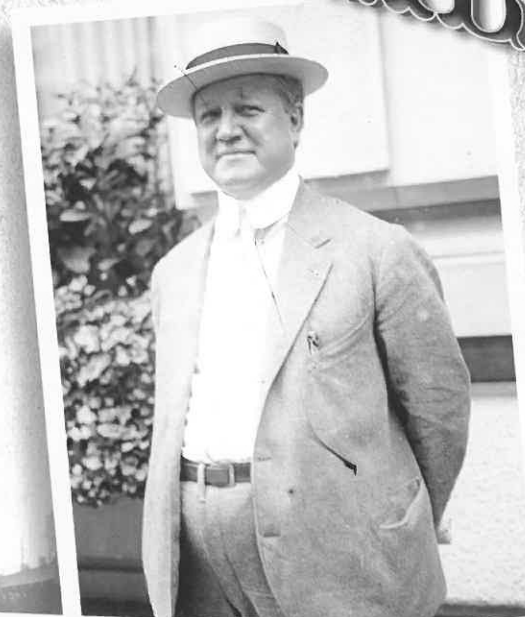
Above right: Charlie Ebbets, 1915.

However, interpretations of that section of the law gradually changed over time; some observers took it to mean that amateur Sunday baseball might be legal if played on private grounds or