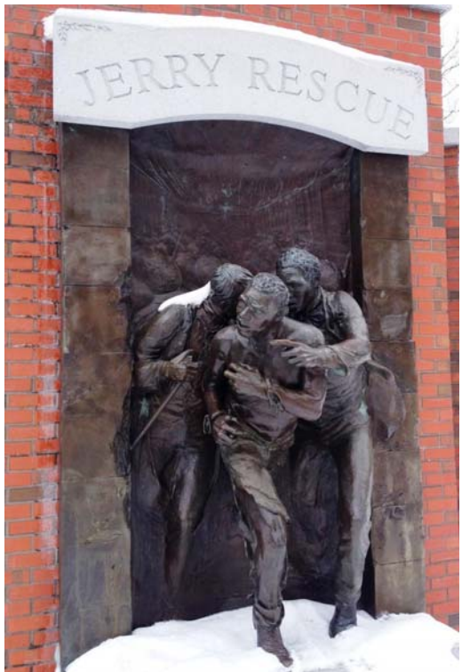
The monument to the Jerry Rescue in Clinton Square.

By <u>SCOTT WILLIS</u> · 20 HOURS AGO SHARE<u>Twitter</u> <u>Facebook</u> <u>Google+</u> <u>Email</u>