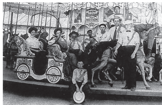
The carousel at Long Branch Park on the northern shore of Onondaga Lake.