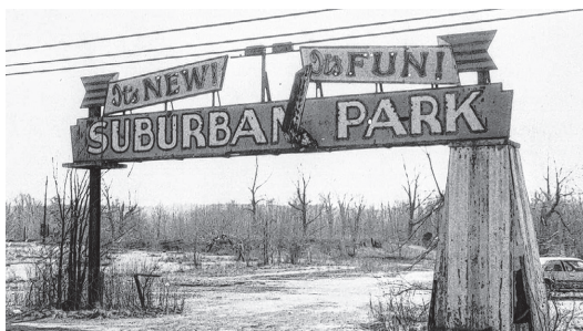
The entrance to Suburban Park outlasted the rest of the park.