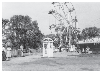
Local residents enjoy a day at Suburban Park, which closed in 1973 after 75 years of operation.