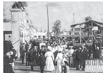
Crowds of people pack the White City Amusement Park on the western shore of Onondaga Lake.

Onondaga Lake has a brighter future, thanks to an improved sewage treatment plant, dredging and capping of toxic sediments, and a new amphitheater. The public may even swim in the water in the near future. But it will be hard to match the level of recreation that previous generations enjoyed by the lake.