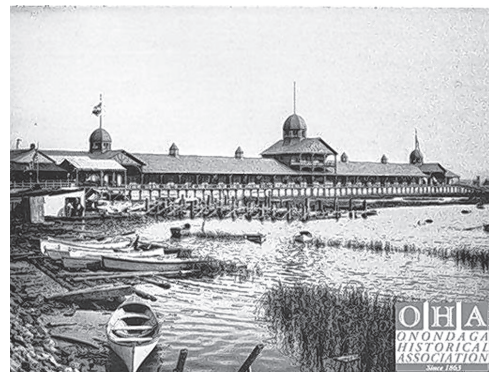
The Iron Pier resort on the southeastern shore of Onondaga Lake, viewed from near the old Salina Pier.