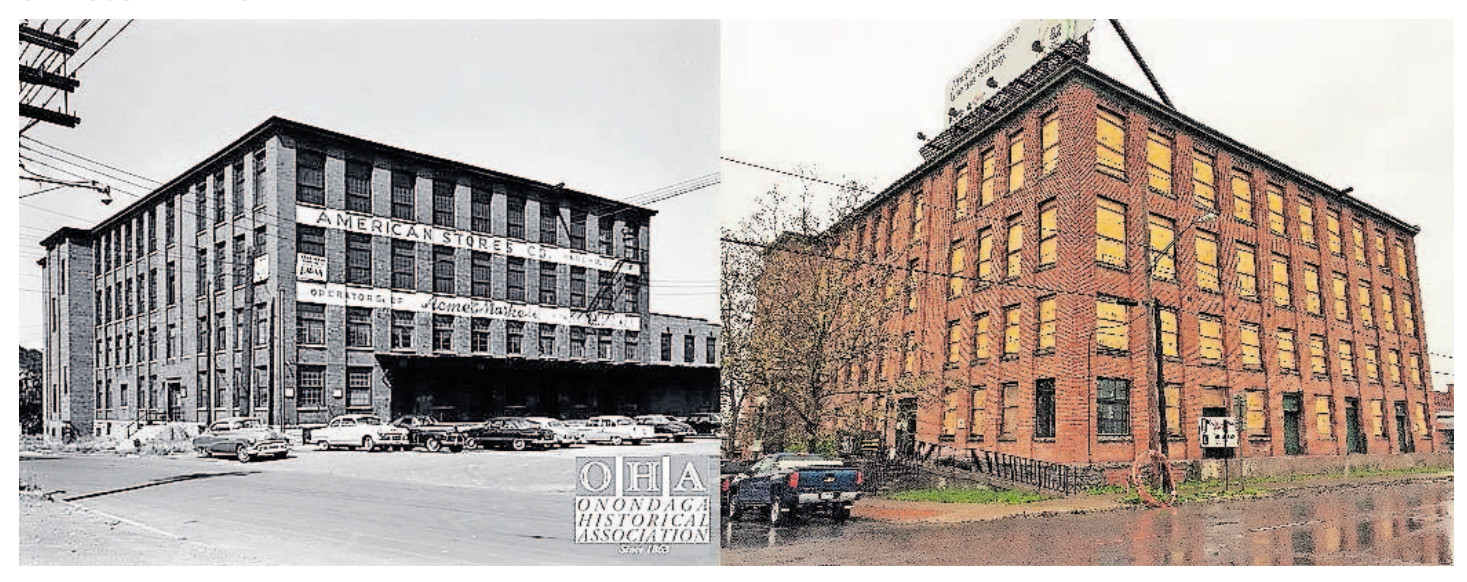
Left, the Oak Knitting Mill building at 102 W. Division St. in Syracuse in 1955, when it was an American Stores Co. food warehouse. Right, the building in 2017 undergoing a transformation into apartments and offices.