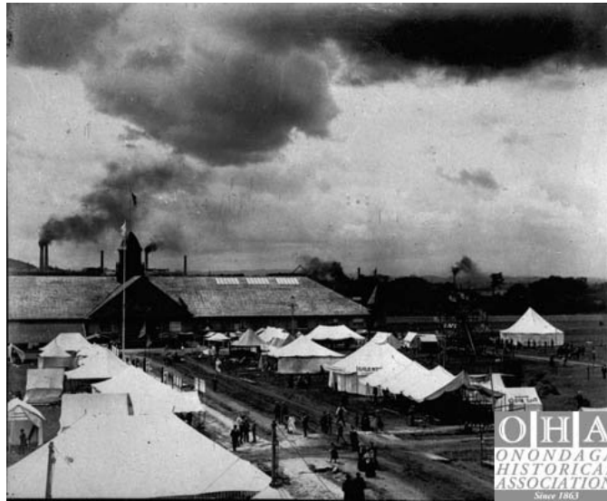
Factory smoke darkens the sky in this early look at the New York State Fairgrounds.