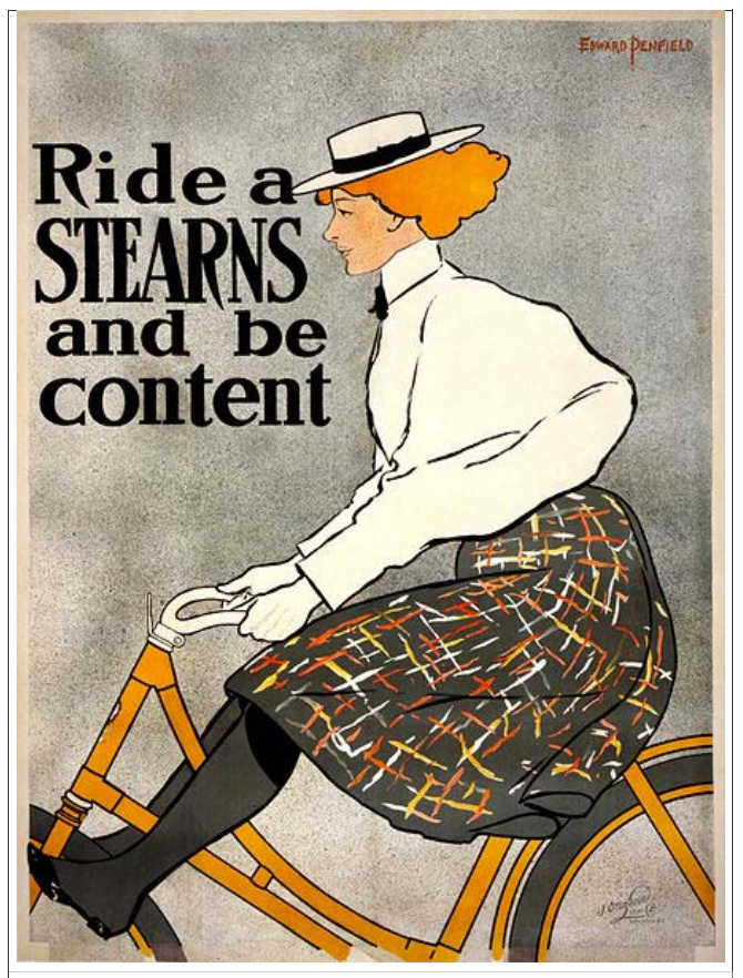
Stearns was headquartered in Syracuse (1896 advertisement)

Did you know that Syracuse was once a booming hub of bicycle manufacturing?