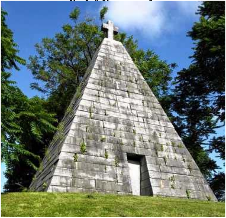
The Cornelius Tyler Longstreet mausoleum is a pyramid that was erected in 1875 in Oakwood Cemetery. Guided tours of the cemetery and visits with actors portraying some of the city's famous and infamous buried there are featured during "Oak Visions," organized by Onondaga

Syracuse -- If you hear voices and see apparitions in Oakwood Cemetery