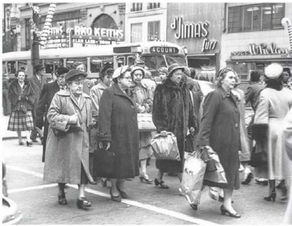
Shoppers are out in force on South Salina Street near Jefferson Street in 1954.