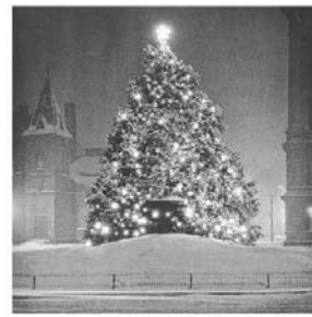
The Syracuse municipal Christmas Tree at St. Mary's Circle, now Columbus Circle. "Silent Night, Holy Night is an apt title for this splendid nocturnal study," editors wrote about this image in 1929. (, Dec. 22, 1929)