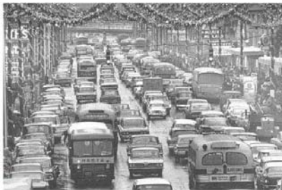
Traffic fills South Salina street two days before Christmas. (Staff photo, Dec. 23, 1953)