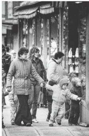
Children go window-shopping downtown. (Jim Commentucci, Dec. 18, 1984)

Some grand old department stores may be long gone, but our city still calls us downtown, to linger at the lights, skate around the ice and take a moment to be of good cheer.