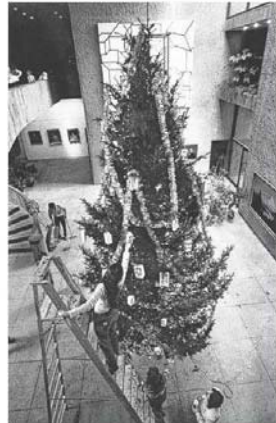
North Syracuse High School students trim a 24-foot Christmas tree at Everson Museum. (Photo by Onacio Pizana, Dec. 16, 1976)