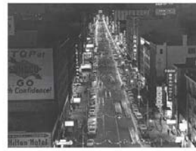
View of South Salina Street from the Chimes Building during the Christmas season. (Photo by Carl Skjole, December 1966)