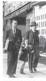
People walk through downtown Syracuse in 1938.