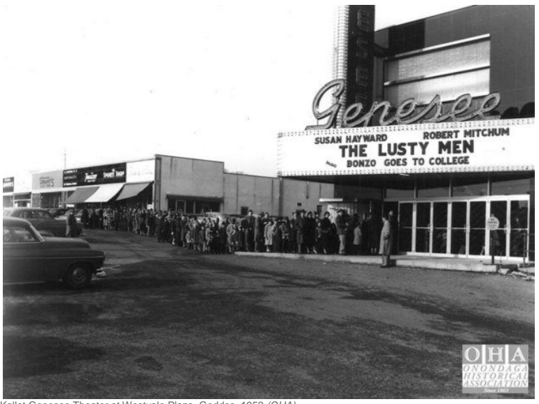
Kallet Genesee Theater at Westvale Plaza, Geddes, 1952 (OHA)