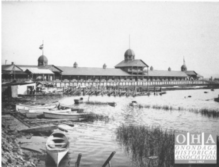
The Iron Pier resort on the southeastern shore of Onondaga Lake, viewed from near the old Salina Pier.

The Destiny USA shopping mall wasn't the first attraction to bring entertainment options to the lake's south shore. A hundred years before the mall was built, there was the Iron Pier.