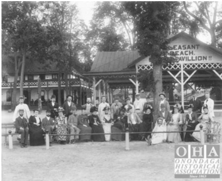
Visitors pose for a picture in front of the pavillion at

Pleasant Beach on the western shore of Onondaga Lake.