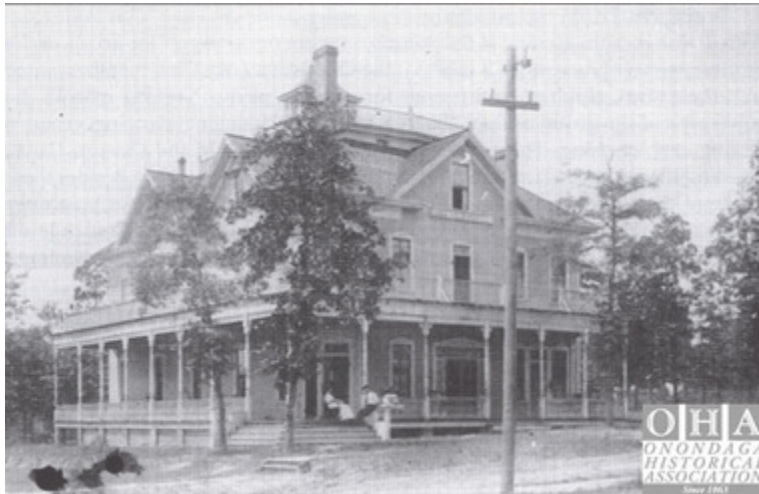
western shore of Onondaga Lake.