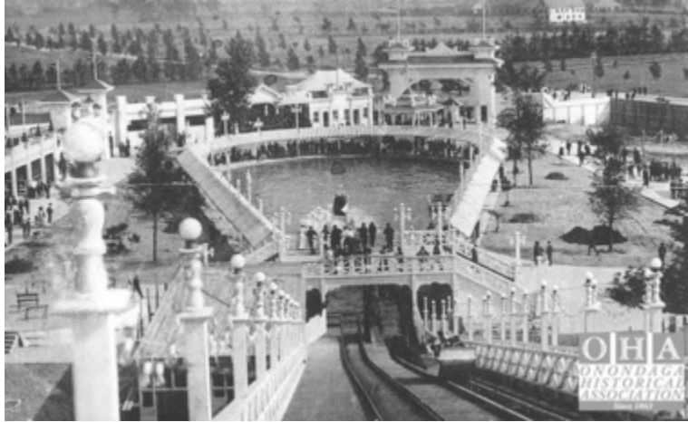
A water ride at White City Amusement Park on the

western shore of Onondaga Lake.