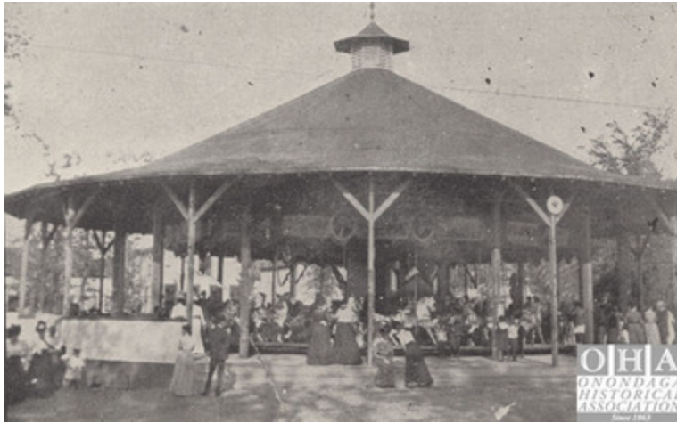
A carousel was among the attractions at Maple Bay, later Lakeside Park, on the western shore of Onondaga Lake.

The county's West Shore Trail begins south of Long Branch Road. The trail curves around to the left, then heads straight south. At the curve is an alcove named Maple Bay. That's where Maple Bay Resort opened in 1889. Its name was later changed to Lakeside Park.