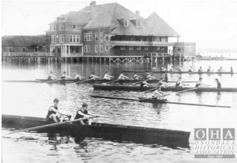
The Syracuse Yacht Club opened in 1898 on the western shore of Onondaga Lake, near what is now Interstate 690. It burned down in 1917.

One of the most impressive looking structures on the lake had to be the Syracuse Yacht Club.