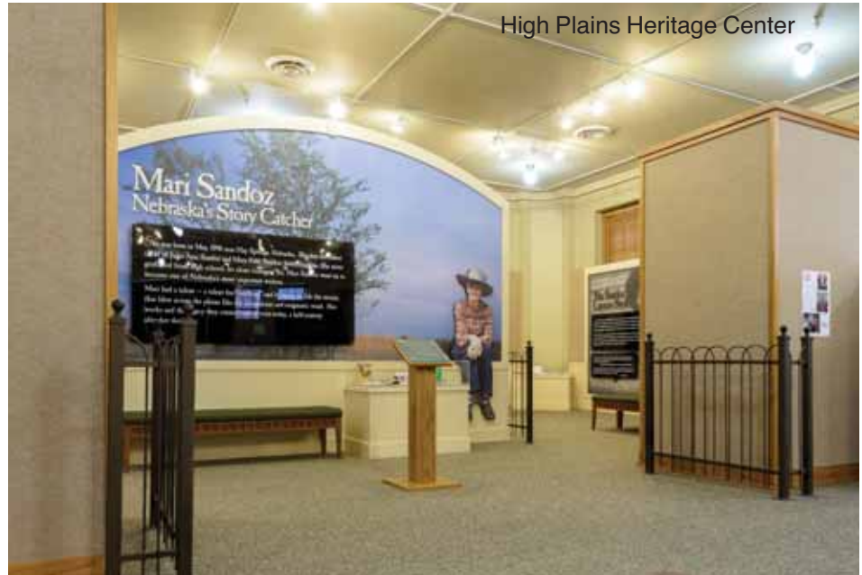
High Plains Heritage Center

after decades of planning and gathering of private contributions. Named for renowned Nebraska author, Mari Sandoz, the Center is housed in the renovated former Carnegie-style College Library, which is on the National